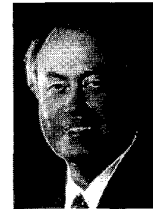
image processing system for surveying distress in road beds. In 1990, he joined Arizona State University, where he is now an assistant professor in the Department of Electronic and Computer Engineering Technology. He is currently working on projects to develop an image-processing system for the recognition of breast cancer using infrared imaging. Other interests include the use of reconfigurable computing elements for high-speed image processing and computer vision.